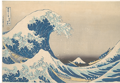
The Great Wave Off Kanagawa, From the Series: "Thirty-six Views of Mount Fuji"

How does a balance of formal, thematic, and contextual qualities reveal layers of meaning?